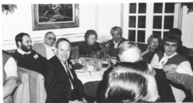
Others enjoying the festivities. How many can you recognize ?